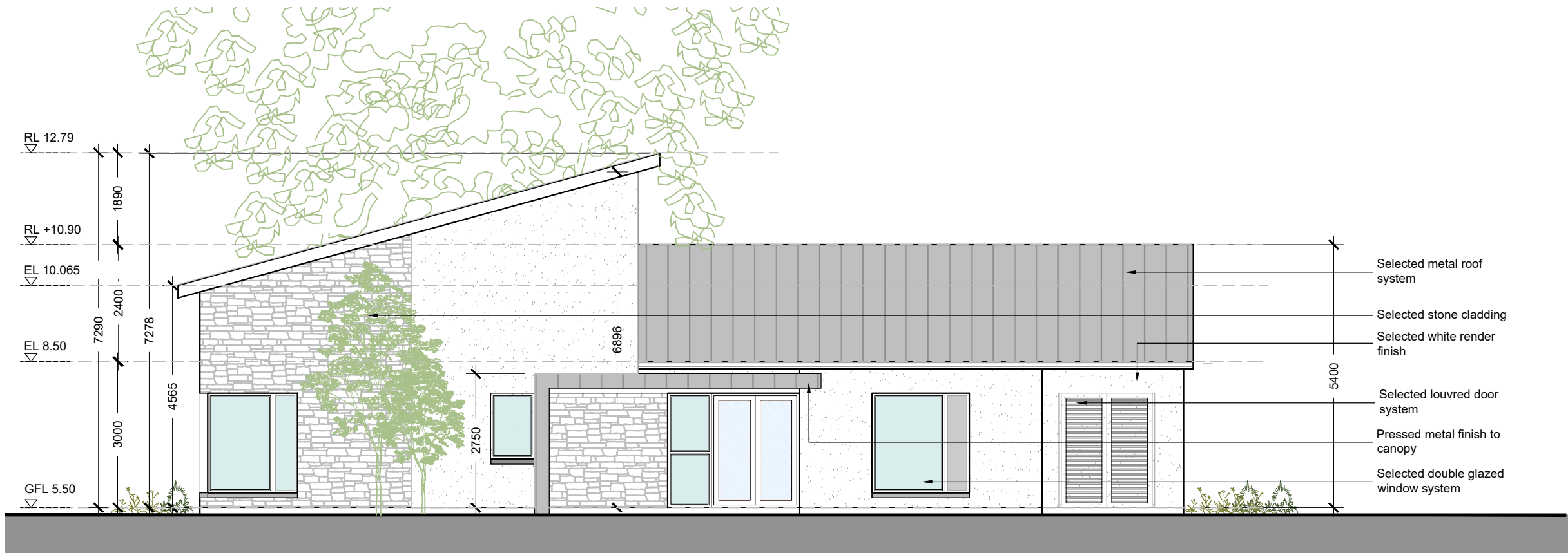
01 Front Elevation (East) 1:100 @ A3