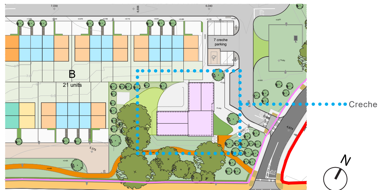
Plan not to scale