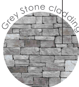
Grey Stone cladding