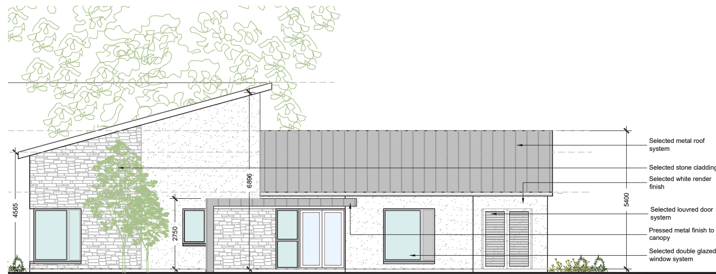
South Elevation | not to scale

The selected building finishes will utilise the houses materials and maintain an overall aesthetic balance throughout the scheme. The unique design of the building will be a key feature of the scheme.