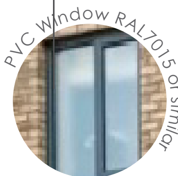
PVC Window RAL7015 or similar

The selected materials were chosen to sit harmoniously within the grey Galway palette and to reflect the maritime character of Oranmore.