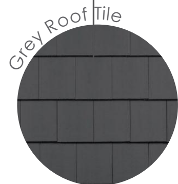
Grey Roof Tile