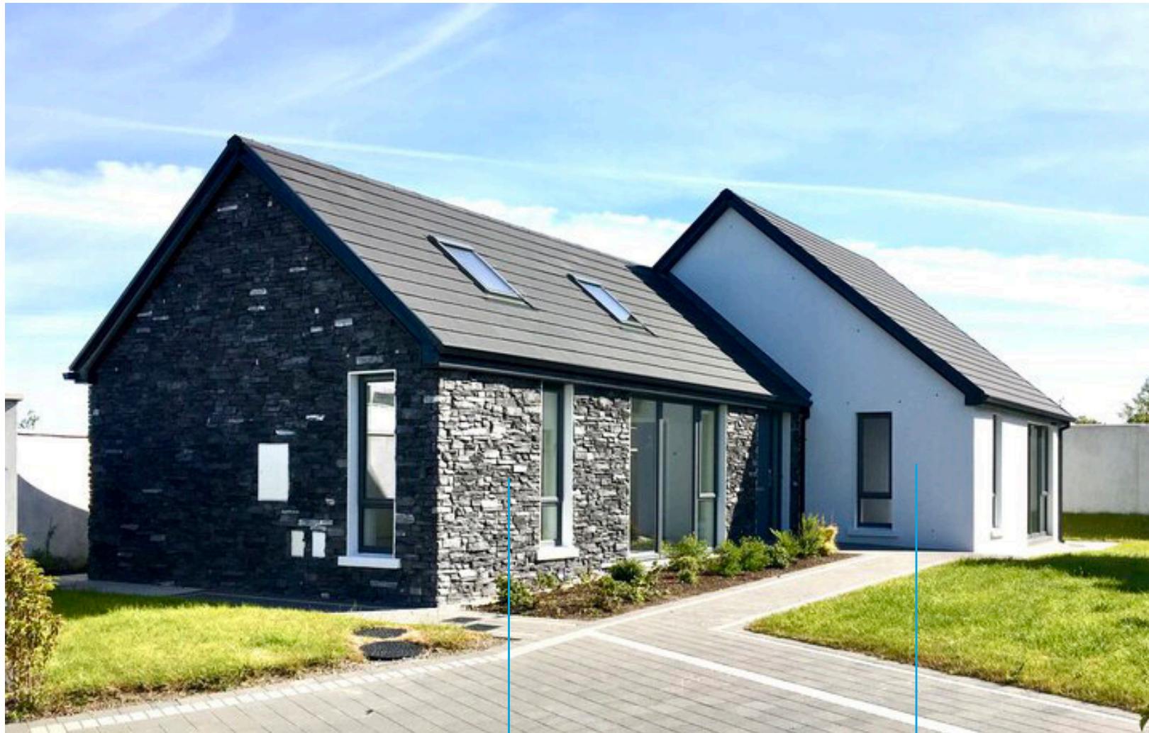
Example of unweathered grey stone cladding