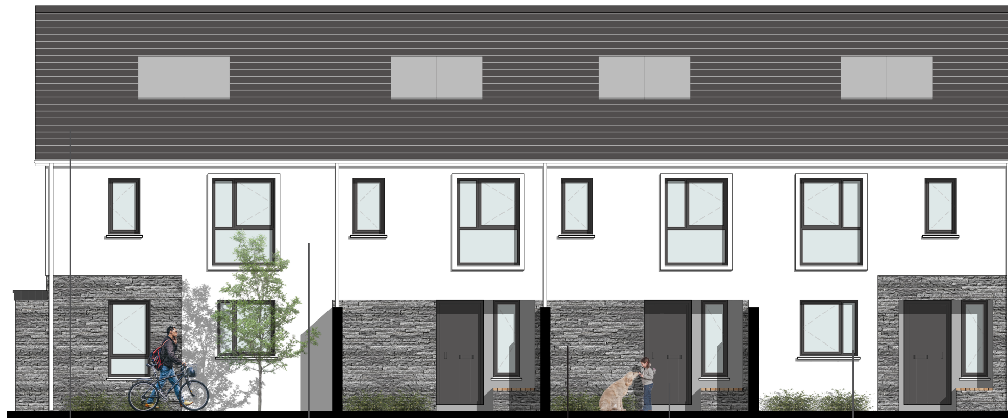
Extract of Cell H south elevation | not to scale