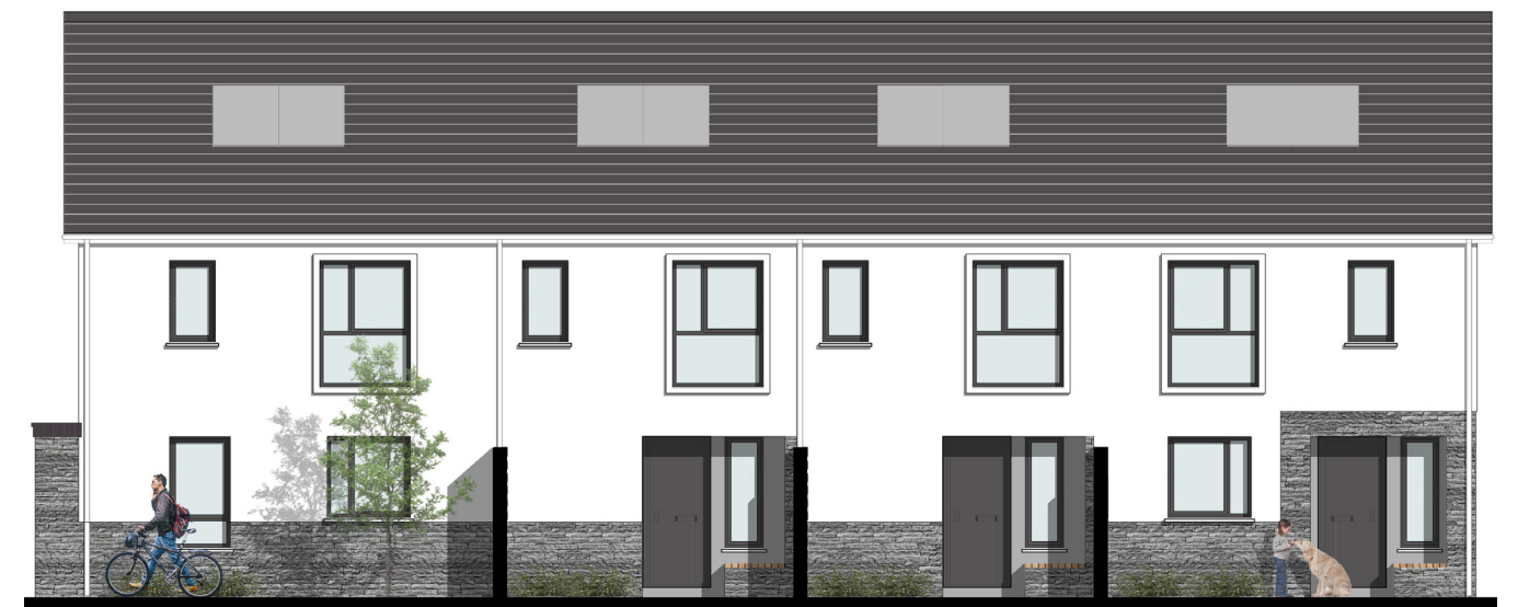
Indicative elevation | not to scale

The materials will be used in a distinct pattern of a low level stone clad plinth on mid terraced units and stone clad to the entrances on end of terrace and semi detached units. The use of more render in this area, aims to bring more light to the inner part of the scheme.