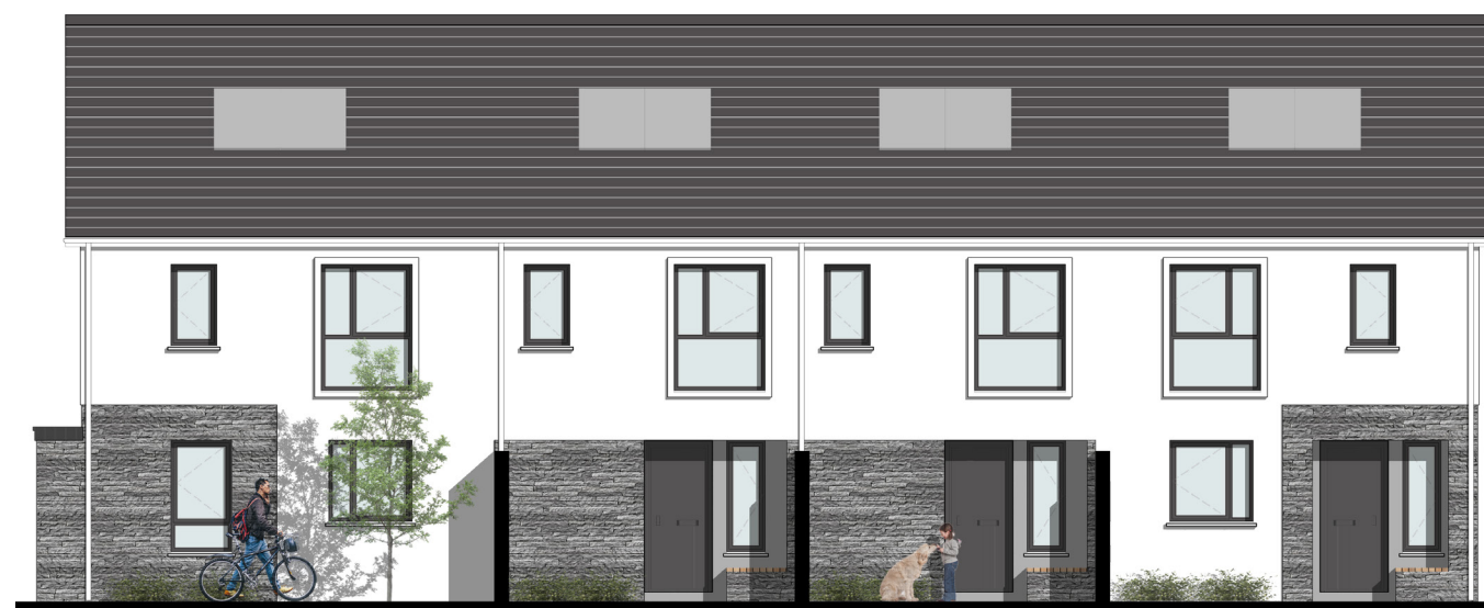
Indicative elevation | not to scale

Running along the south of the site, the grey stone cladding paired with white render in a high-plinth pattern will distinguish the facades in this prominent area of the site. The increased use of grey stone in this character area highlights the existing stone walls along the coast road.