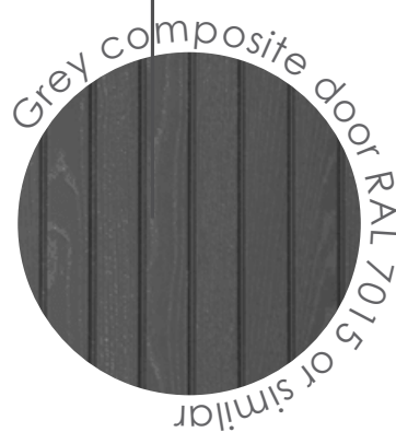
Grey composite door RAL 7015 or similar