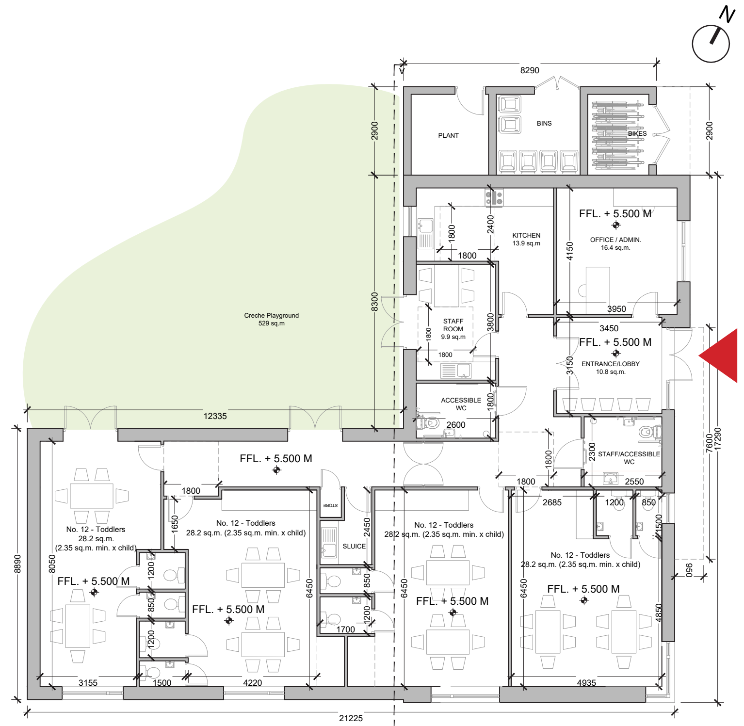
Plan not to scale